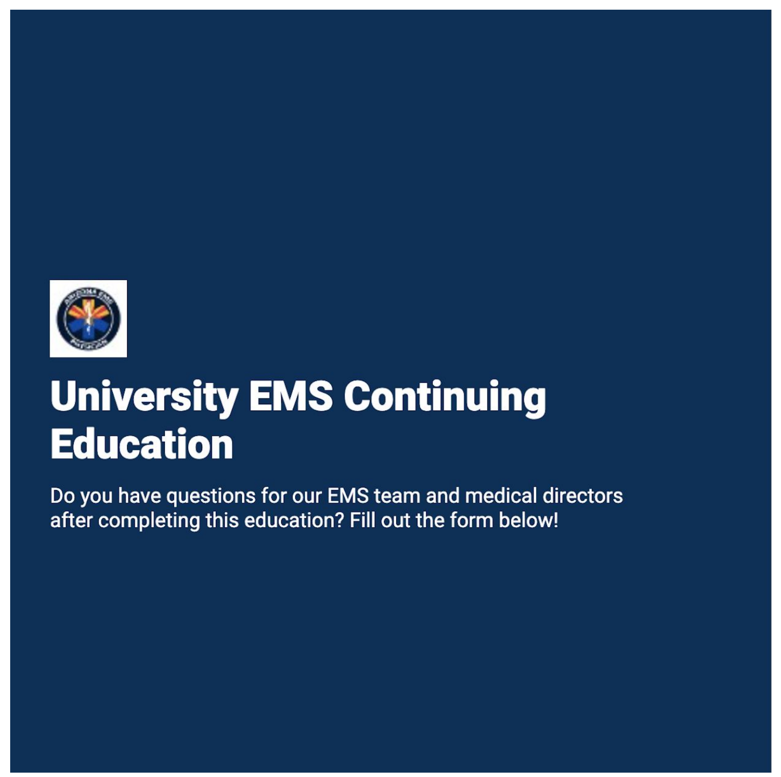
Fig. 2. Question form for each educational module, allowing direct to provider responses.